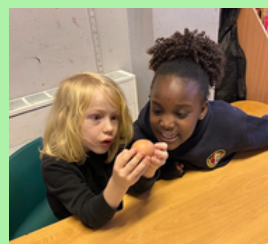
Year 2 PSHE - celebrating differences