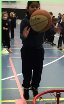
Year 1 at the Three Hills sports morning.