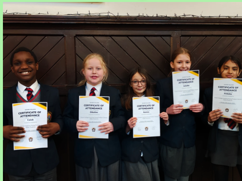
Maths Challenge at Dover College.