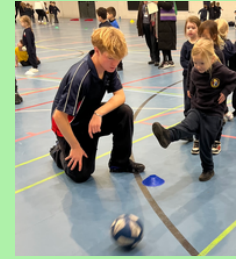
Ducklings fun at the Three Hills