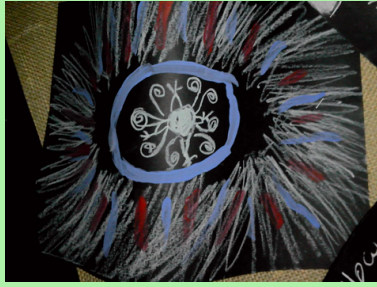
Art Club winter scenes