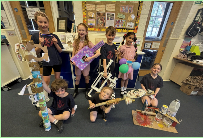
Winners of the musical instruments.