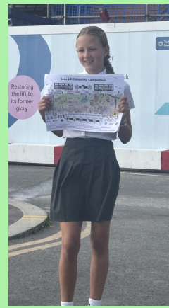
Colouring competition winner.